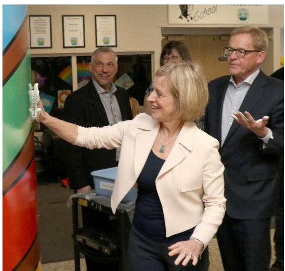
Premier Notley and Minister Eggen took advantage of the opportunity to meet local students and parents during their visit. They also added their handprints to the school's Circle of Courage wall. Below, a group photo of some of those in attendance – young and old